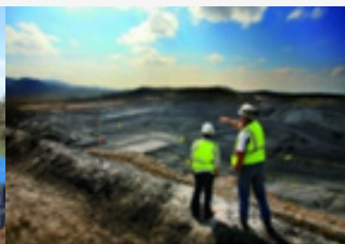
Harita Group Mining Kalimantan