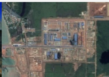
PT Well Harvest Winning Alumina Refinery Kalimantan