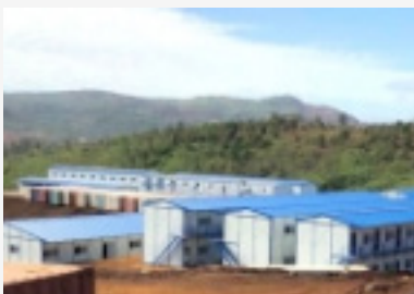
PT Halmahera Persada Lygend (HPAL) Malaku