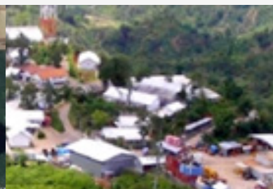
PT Natarang Mining Sumatra